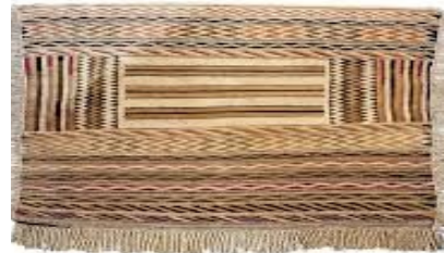
Blanket made with Woolly Dog and Mountain Goat hair.

If you would like to learn more about the Salish Woolly Dog check out: