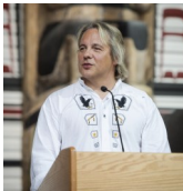
Drew Hayden Taylor

Read about these authors and their works